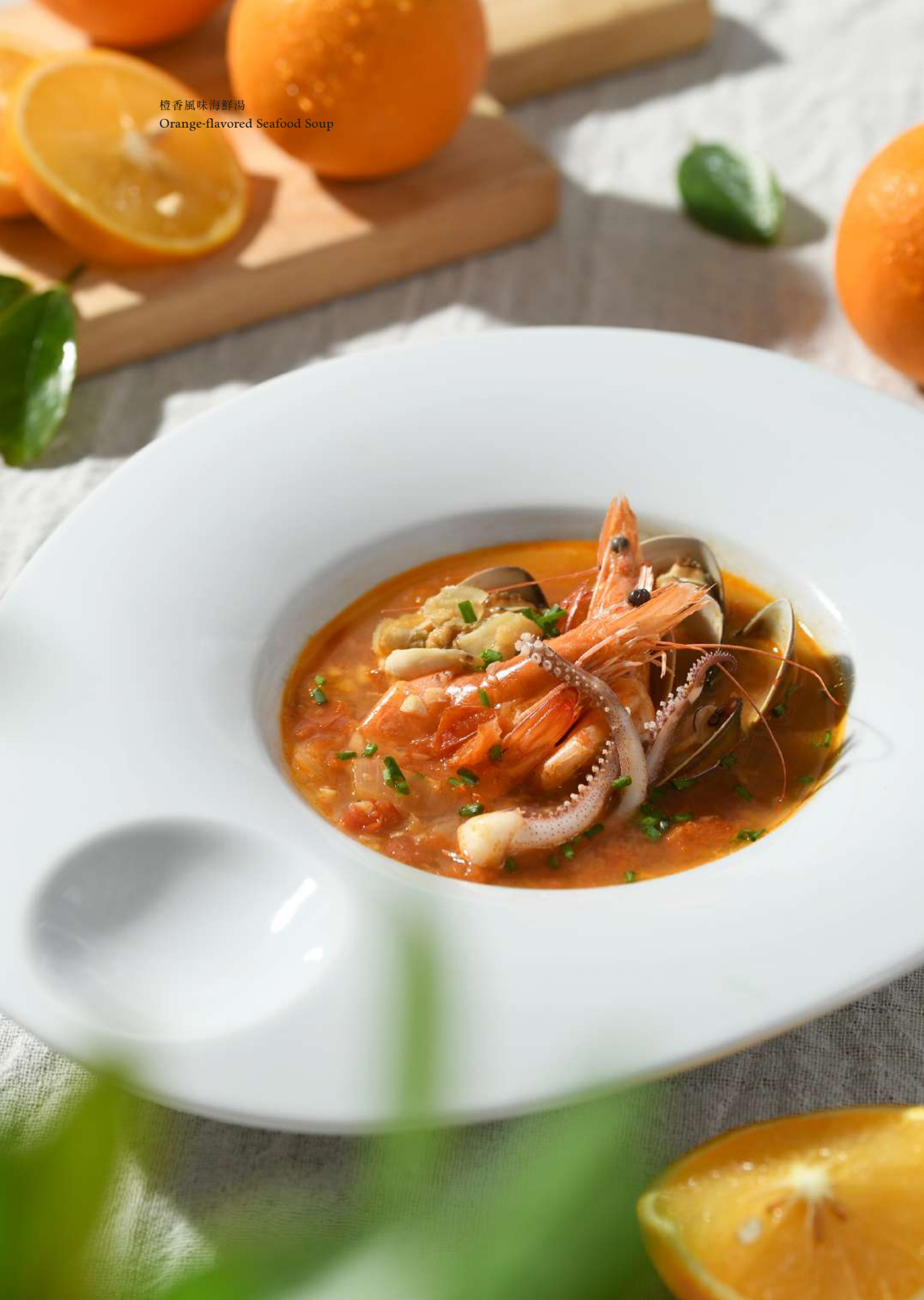
橙香風味海鮮湯 Orange-flavored Seafood Soup