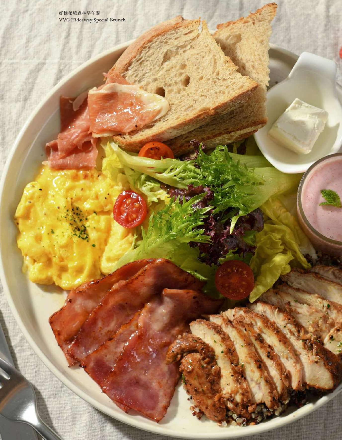
好樣秘境森林早午餐 VVG Hideaway Special Brunch