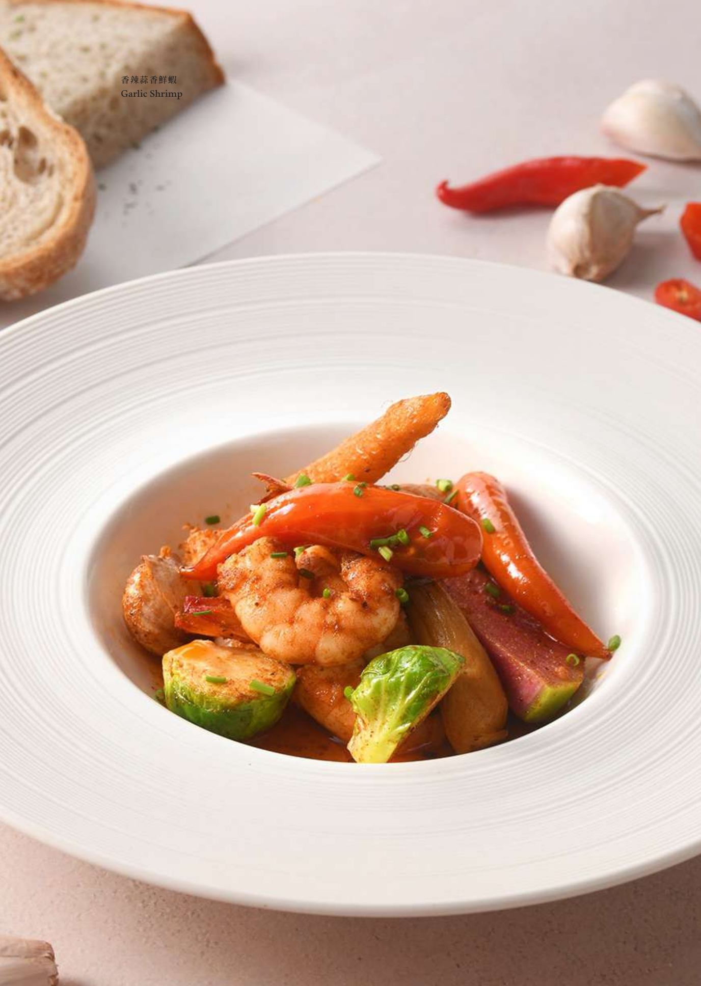
香辣蒜香鮮蝦 Garlic Shrimp