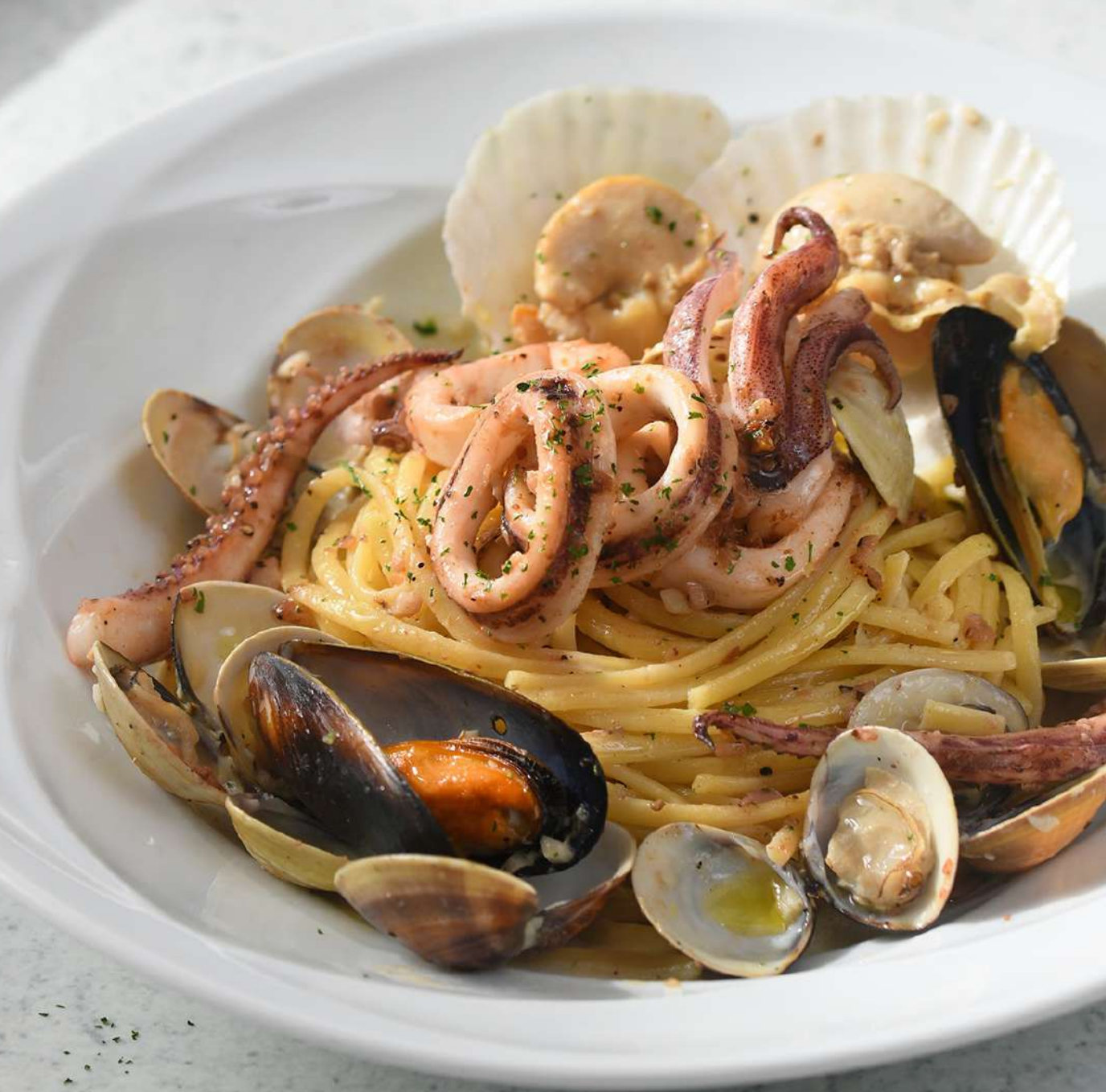
蒜香檸檬奶油海鮮義大利麵 Linguine with Seafood and Creamy Lemon Garlic Sauce