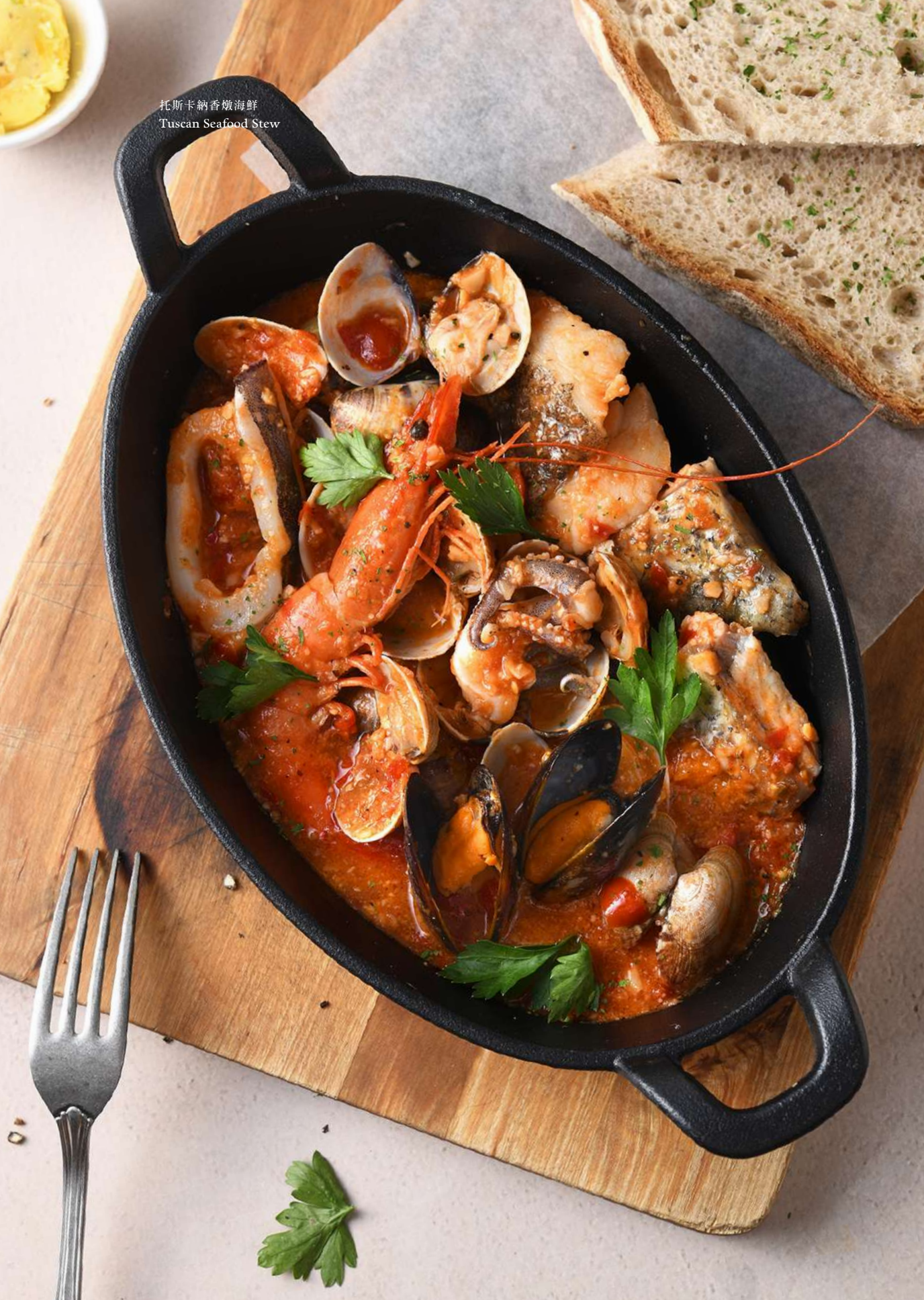
托斯卡納香燉海鮮 Tuscan Seafood Stew