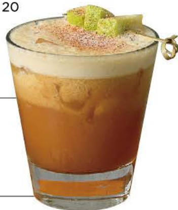
芭樂冰美式 Guava Americano 12oz