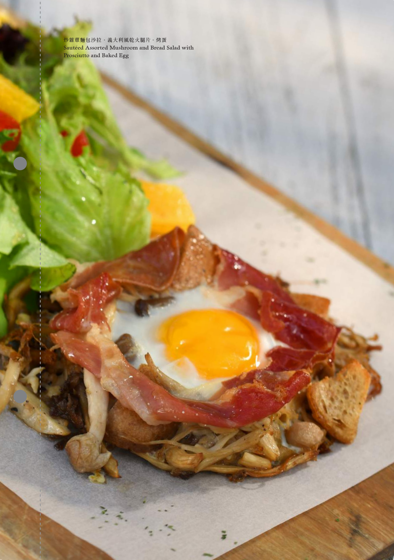
炒雜蕈麵包沙拉·義大利風乾火腿片·烤蛋 Sautéed Assorted Mushroom and Bread Salad with Prosciutto and Baked Egg