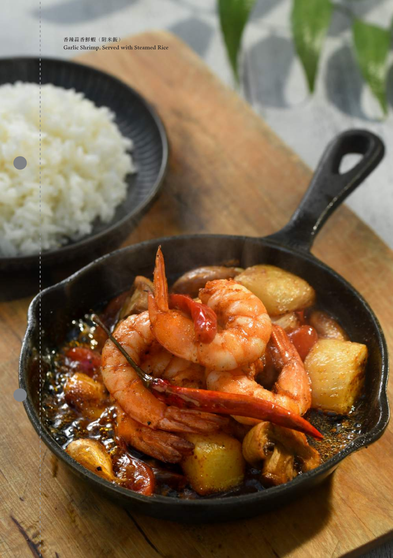
香辣蒜香鮮蝦（附米飯） Garlic Shrimp, Served with Steamed Rice