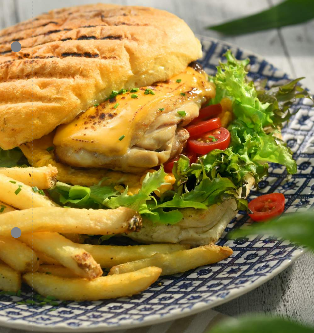
歐姆蛋起司雞腿三明治 · 酥炸薯條 Chicken Omelet and Cheese Sandwich, Served with Chips