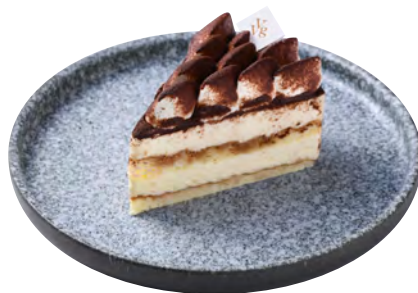
▲ 提拉米蘇慕斯蛋糕 Tiramisu Mousse