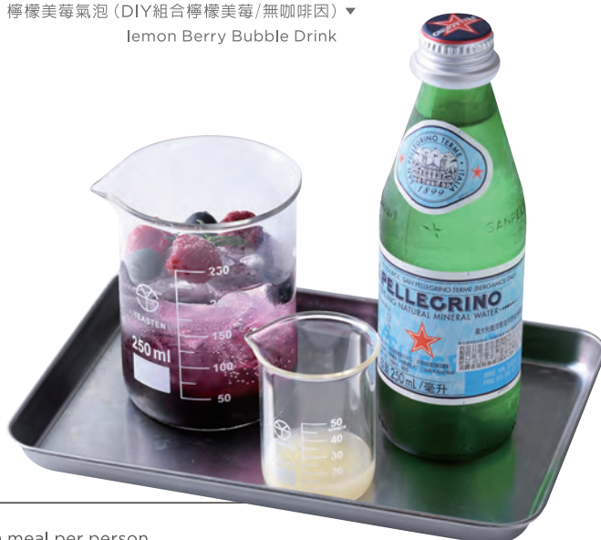
檸檬美莓氣泡 (DIY組合檸檬美莓/無咖啡因) ▼ Lemon Berry Bubble Drink

The minimum order is a drink / a meal per person