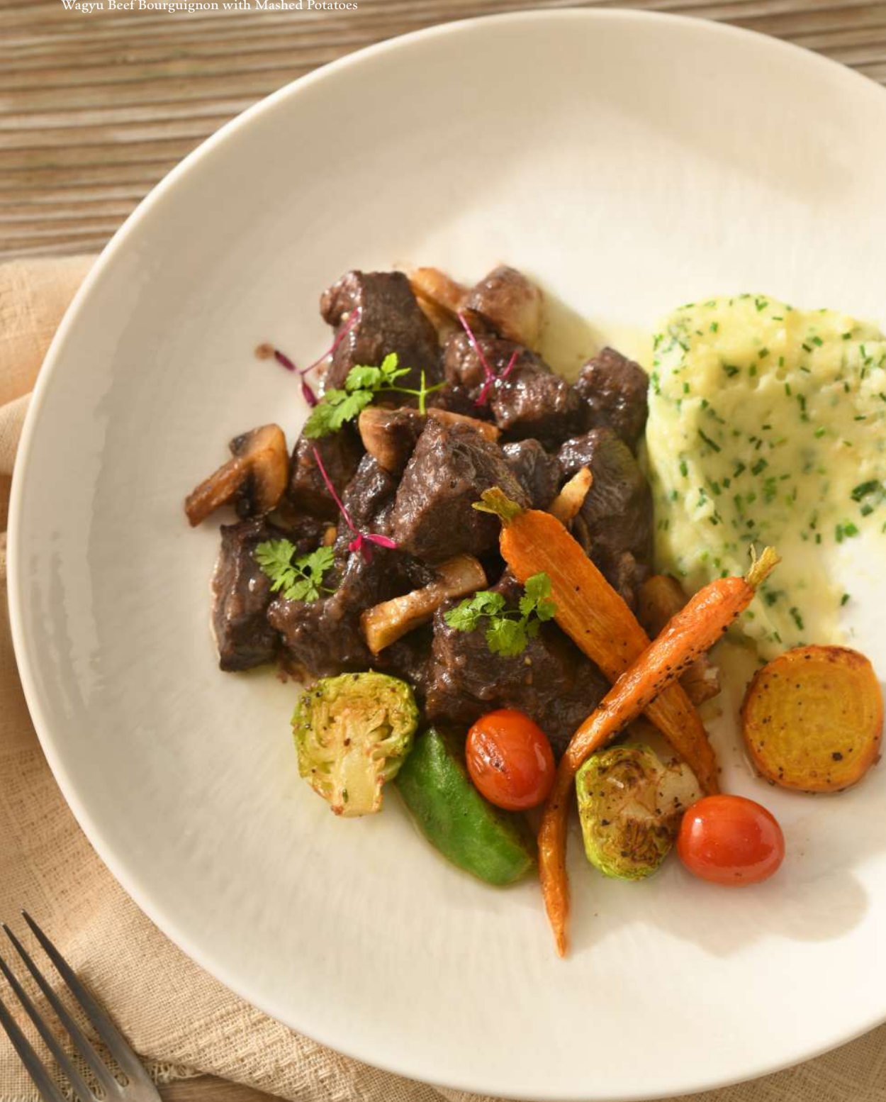
勃根地紅酒燉和牛·薯泥 Wagyu Beef Bourguignon with Mashed Potatoes