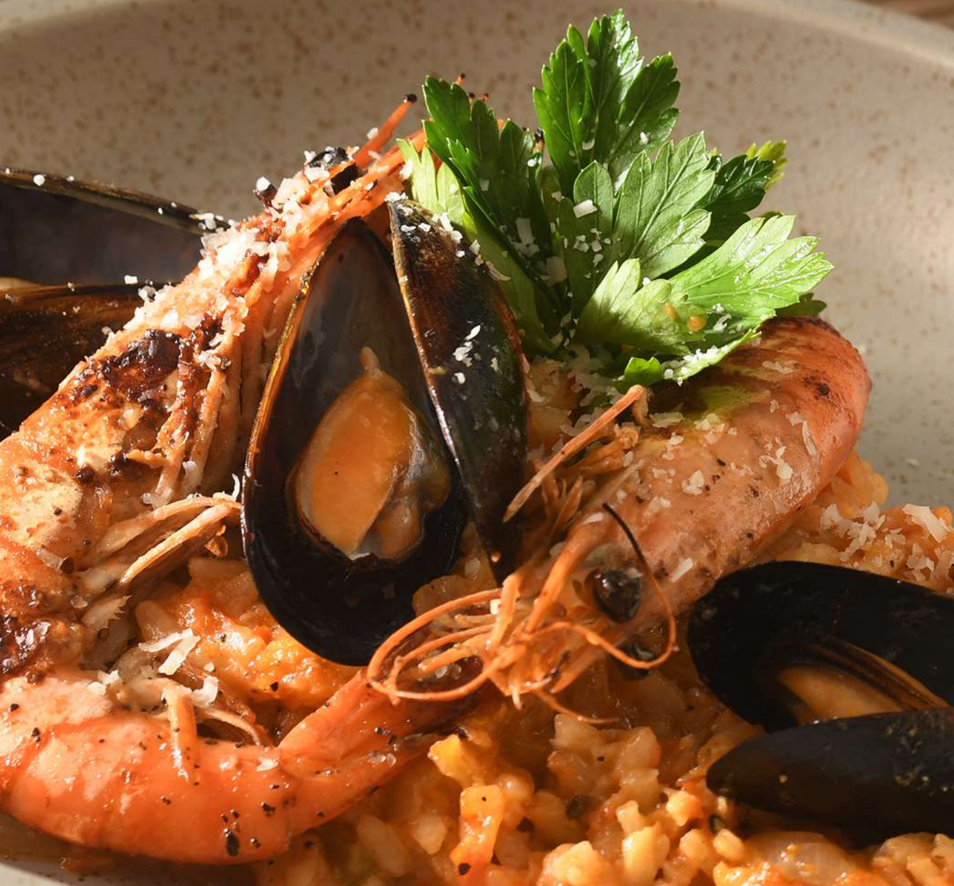
義大利海鮮燉飯 Seafood Risotto