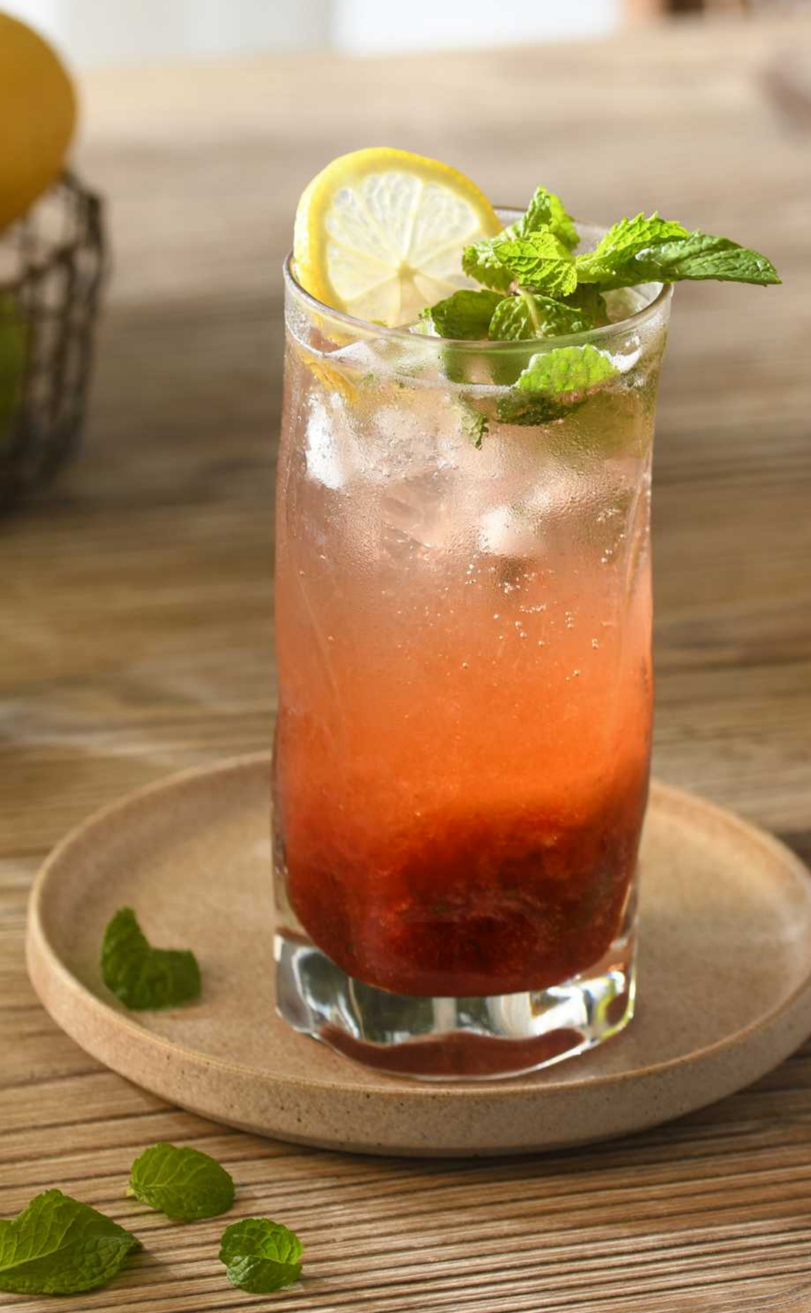
草莓檸檬氣泡飲 Strawberry Lemon Sparkling Drinks