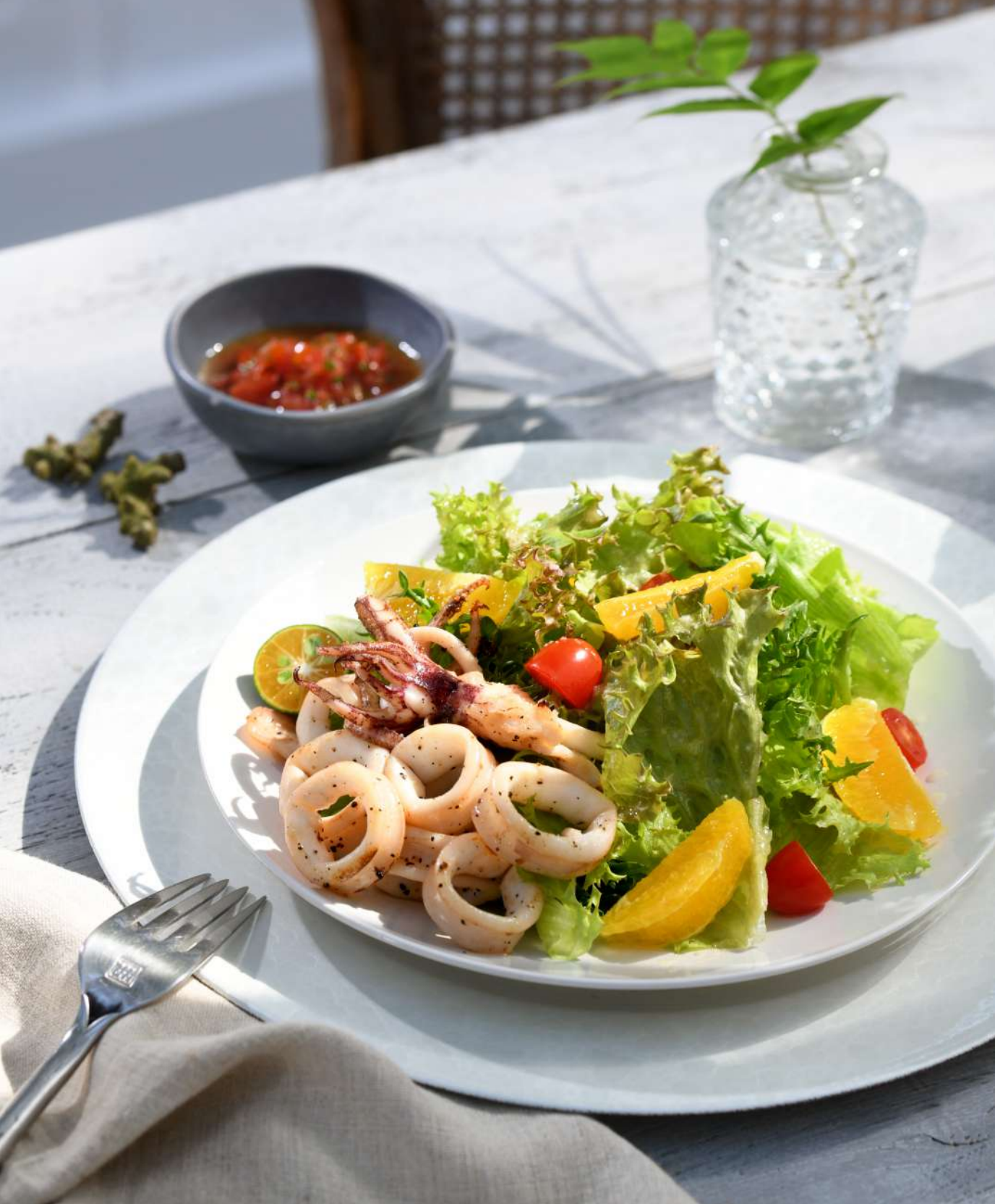
香煎透抽 · 川七零餘子蝦夷蔥醋醬 Pan-Fried Squid with Heart-Leaf Madeira Vine Chives and Vinegar Sauce